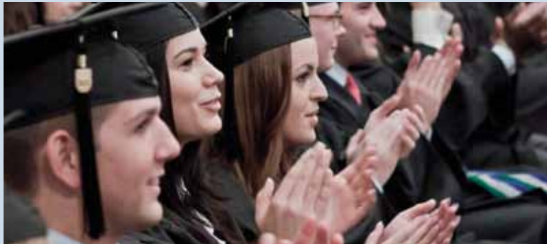
The annual graduation ceremony is held at the beautiful Wiener Konzerthaus.

A degree from Webster University Vienna is accredited in both the U.S. and Austria, and acknowledged everywhere in the world.