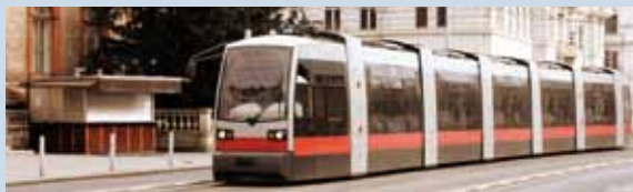
Vienna is a clean and safe city with an excellent public transportation network of underground trains, trams and buses.

An International Center: Bordered by eight countries (Germany, the Czech Republic, Slovakia, Hungary, Slovenia, Italy, Switzerland, and Liechtenstein), Austria has historically been a crossroads among the great economic and cultural regions of Europe. Vienna today is one of the most popular venues in the world for superpower summits, organizational congresses, and business meetings. It is a European headquarters of the United Nations, and the host city for international organizations such as the IAEA, UNIDO, CTBTO, OSCE, and OPEC. Vienna's population is diverse and enjoys a rich mosaic of lifestyles and cultures.